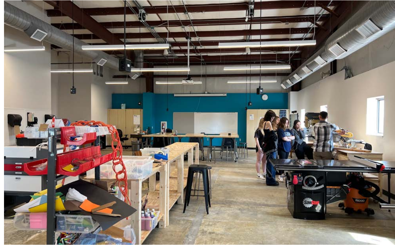
Building wide security improvements, library media center, GEAR, and construction tech renovations.