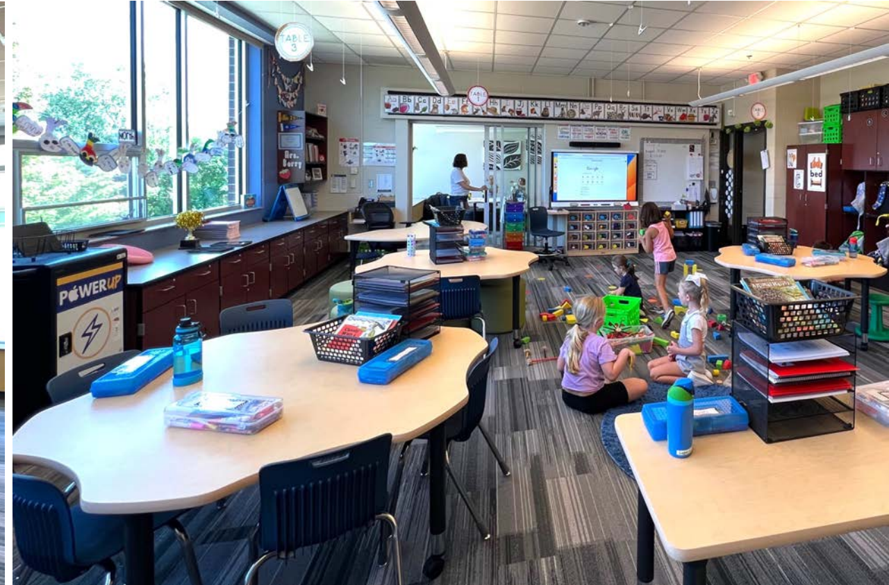
Scope: Transform classrooms into Flexible Learning Environments at TCE and WSE