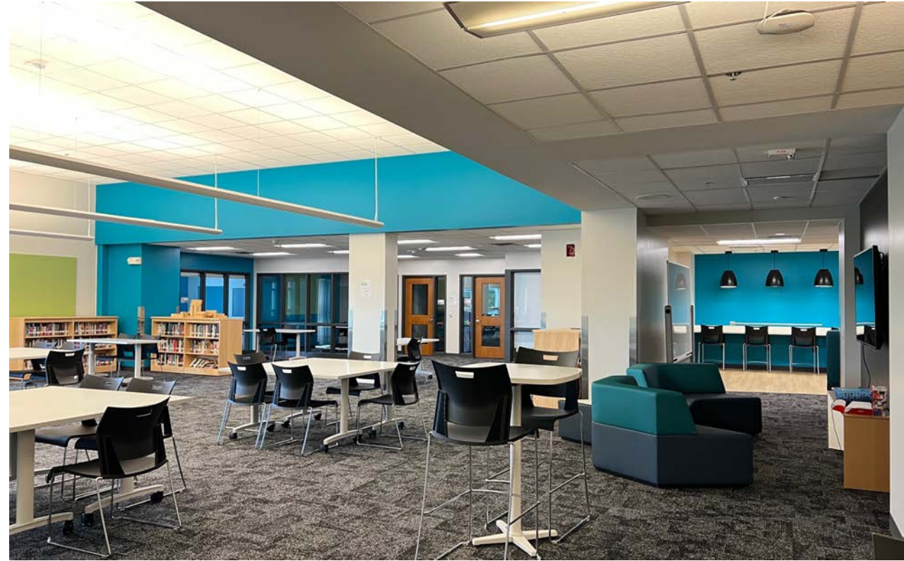
Building wide security improvements, library media center, GEAR, and construction tech renovations.