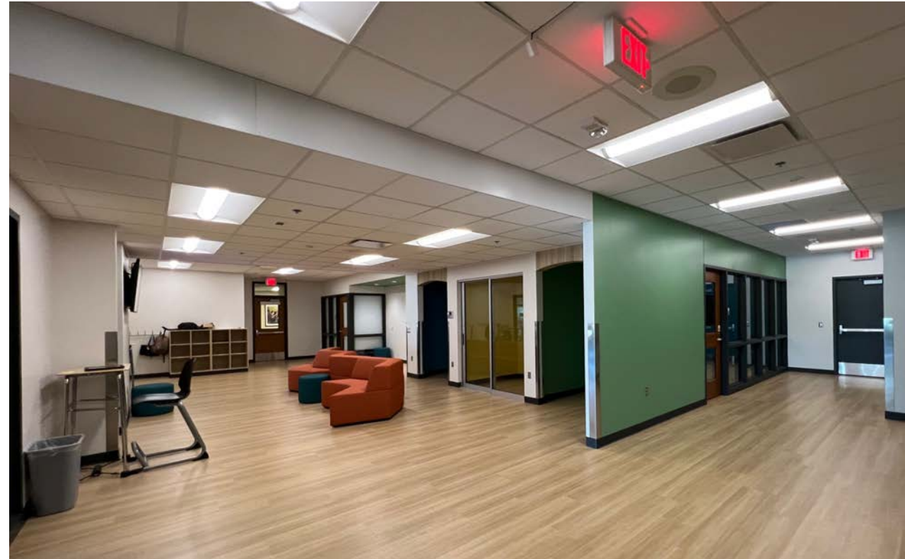
Building wide security improvements, library media center, GEAR, and construction tech renovations.