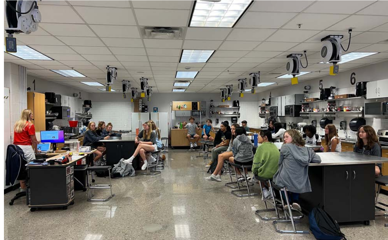
Scope: All middle school FACS renovations.